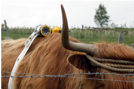
Figure 3. Wireless back-mounted custom built camera on Grace, the Highland cow.

Publicity material accompanying the site was made to resemble closed-circuit television (CCTV) norms, with the difference that in cow-cam.tv everyone had access to its footage but nobody had control over where the camera was pointed except Grace. The intention was to liberate the viewer from the need of control and allow him/her to be immersed in the experience of the natural surroundings.