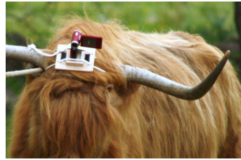
Figure 4. Head mounted camera.

A form on the website allowed visitors to provide feedback and thoughts on the hosted videos and images, while social media were used to promote the site. One of the main patterns arising from comments left by visitors was empathy with the animal and surrounding nature. Messages such as “why would you kill such a beautiful animal?”, “you make me miss the countryside”, “I love the cow-cam, it is so relaxing” and “I’m going to get rid of the television!” suggested that cow-cam.tv made room for contemplation and reflection on one’s urban routine and facilitated a reconnection to something of value that was perhaps forgotten. Calling attention to our society’s obsession with surveillance, some visitors wondered if using a “friendlier” type of CCTV, such as this, could be an option in cities. However, some visitors did not appreciate the offered experience, calling for more action in the footage. An established UK-based advertising agency was envisioning the use of cow-cam.tv footage for an online campaign for one of its clients with the addition of dialogues between the animals portrayed.