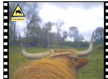
Figure 5. Recorded footage from the back mounted camera.

A form on the website allowed visitors to provide feedback and thoughts on the hosted videos and images, while social media were used to promote the site. One of the main patterns arising from comments left by visitors was empathy with the animal and surrounding nature. Messages such as “why would you kill such a beautiful animal?”, “you make me miss the countryside”, “I love the cow-cam, it is so relaxing” and “I’m going to get rid of the television!” suggested that cow-cam.tv made room for contemplation and reflection on one’s urban routine and facilitated a reconnection to something of value that was perhaps forgotten. Calling attention to our society’s obsession with surveillance, some visitors wondered if using a “friendlier” type of CCTV, such as this, could be an option in cities. However, some visitors did not appreciate the offered experience, calling for more action in the footage. An established UK-based advertising agency was envisioning the use of cow-cam.tv footage for an online campaign for one of its clients with the addition of dialogues between the animals portrayed.