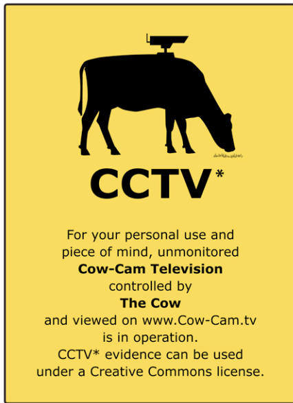
Figure 1. Poster describing the Cow-Cam.tv experiment

The recorded footage was shared with the public online, under a creative commons license while a future version could offer live Internet video streaming.