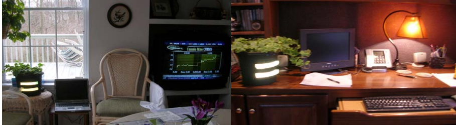
Figure 3. Ambient plant pots deployed in participants' homes

perceived shared space across households without “ doing anything special ,” illustrating this mode of ambient interaction appears qualitatively different from engaging with static or asynchronous forms of communications, such as looking at photos, touching a device, or sending direct messages. Spontaneous interactions also emerged as the device transitioned from the ambience to the foreground when participants remotely interacted with each other by waving their hands to change the display color as sensors detected their close proximity movements.