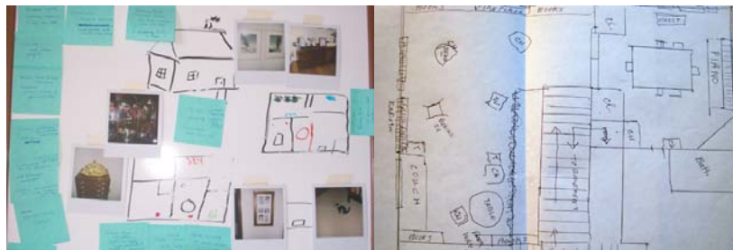
Figure 1. Maps of relationships between domestic activities and objects

To develop a deeper understanding of everyday elderly life, we conducted in depth contextual interviews with two couples (P1, P2)—all participants were in their mid-70s and exhibited reasonably well health and activity levels. We drew on the previous literature investigating the essential role the home plays in ongoing identity construction [9, 7] and research on the emotional effects of aging [6] to ground our exploration of participants' relationships with objects and spaces in their homes. Our interview process involved: (i) asking participants about their activities and relationships, (ii) touring participants' homes and documenting personal objects they held deeply meaningful, (iii) observing participants sketching relationships among common domestic activities and objects, and (iv) posing general questions about their perceptions of non-digital and digital objects.